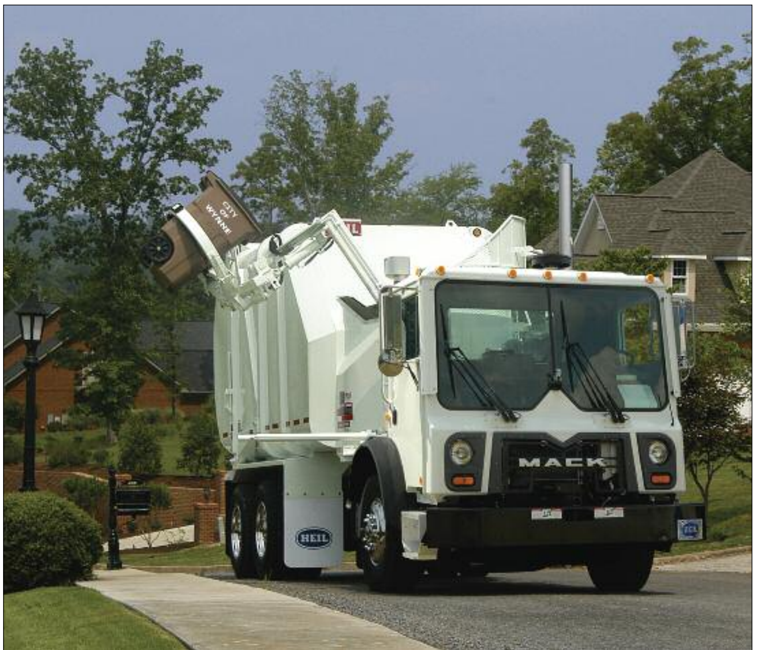
State-of-the-art automated collection trucks like this one will soon be collecting household trash in the city of Wynne

Garbage collection will be significantly more efficient using the carts and the automated trucks. Less manpower will be required, since only one operator is needed for the truck instead of the two- and three-man crews now used. On-the-job injuries for solid waste employees should be drastically reduced, saving the city in workman's compensation claims, reducing overall labor costs, and helping the